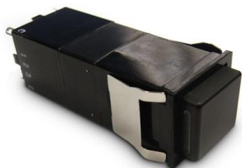
FLIGHTDECK FDS - EM1 "PRO-M" Series Switch